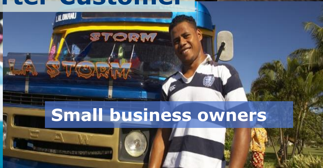
Small business owners