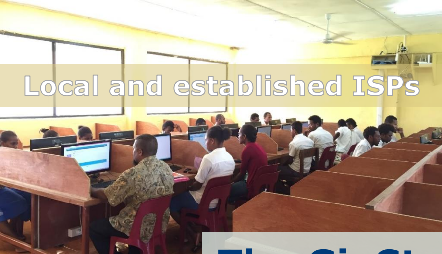
Local and established ISPs